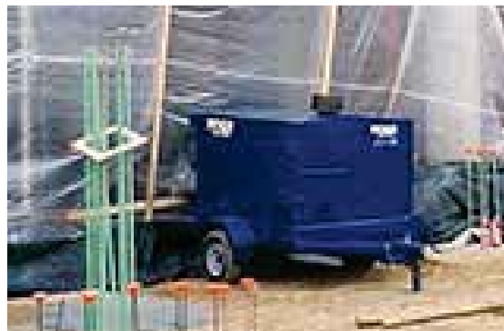
Typical uses for The TIOGA Air Heater